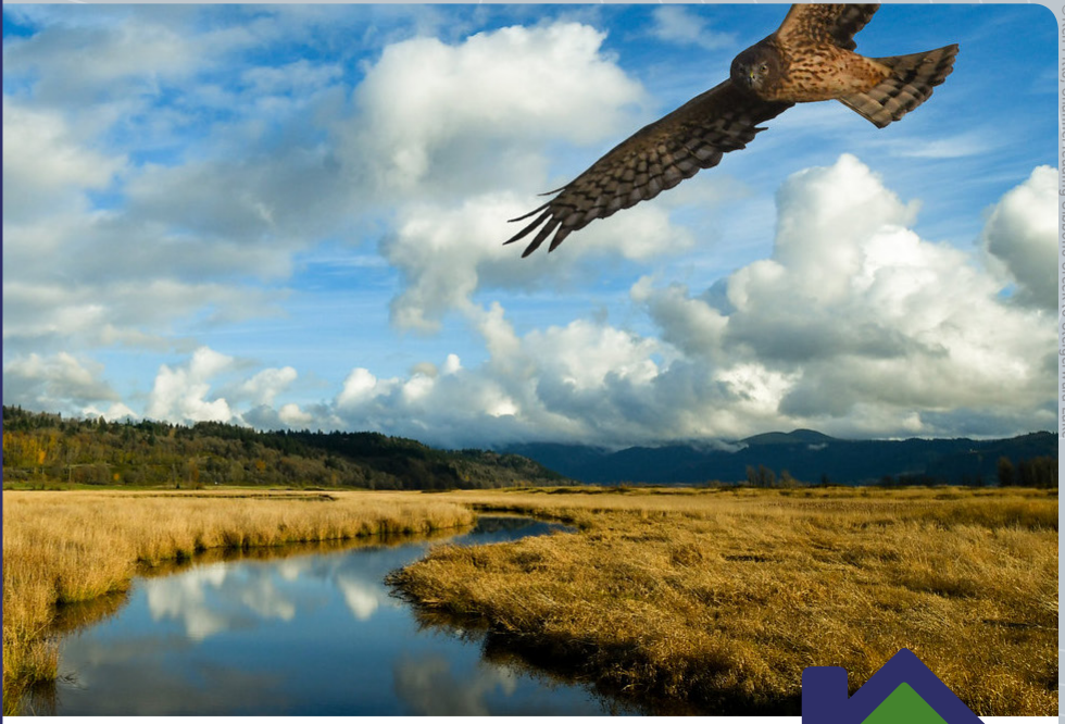
Channel leading Gibbons Creek to Steigerwald Lake

Since its designation as a National Wildlife Refuge in 1987, Steigerwald Lake has evolved into a beloved destination for travelers and neighbors from both sides of the Columbia River. Stunning views, meandering trails, and an amazing mix of birds invite a sense of wonder. Now, another evolutionary leap is underway. Through the Steigerwald Reconnection Project, the Refuge is poised to fulfill its promise as both a haven for wildlife and an Urban National Wildlife Refuge, greatly enhancing habitat for aquatic and terrestrial species while partnering to address critical community needs. The project will restore a direct tie between Refuge lands and the waters of Gibbons Creek and the Columbia that has not been seen in generations. As wetland habitat improves, so too will the quality of life for Refuge neighbors, through flood protection, jobs, and the health benefits of a deeper connection to nature.